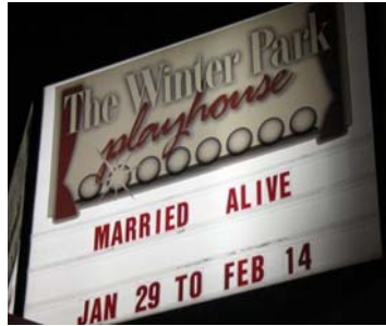
This is the only photo from the outing to Winter Park Playhouse this month for Inside the Arts. A camera malfunction! The play and dinner were enjoyed by all.